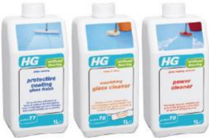
HG P77 HG P78 HG P79