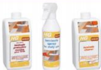
HG P70 HG P71 HG P72