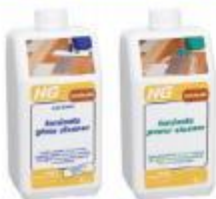
HG P73 HG P74